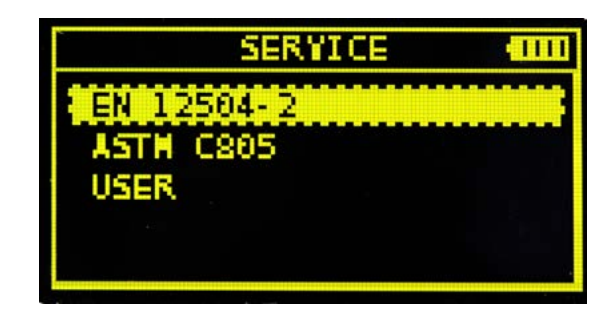
Example of digital hammer screen display - Selectable Standard