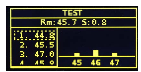
Example of digital hammer screen display – Test results displayed as numerical and graphical