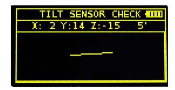
Example of digital hammer screen display - Measurement and indication of the exact instrument tilting angle by triaxial inclinometer