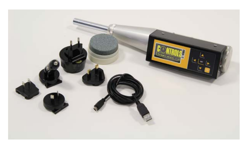
Rebound test hammer digital model 58-C0181/DGT