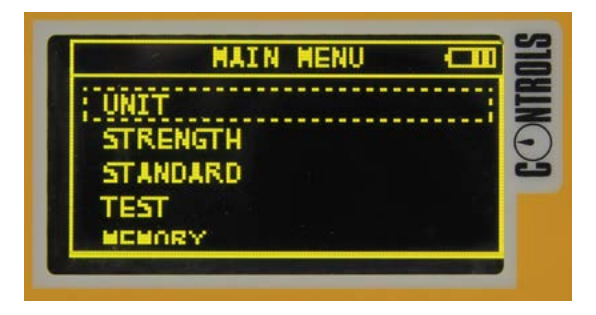
Example of digital hammer screen display - Main menu