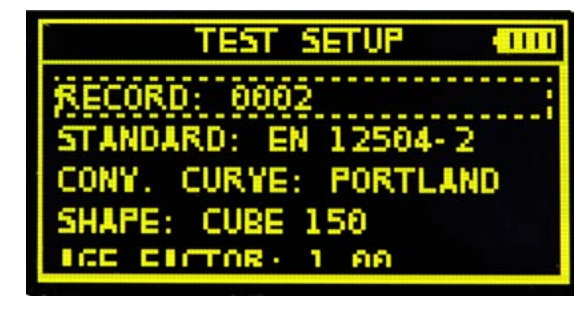
Example of digital hammer screen display - Test setup