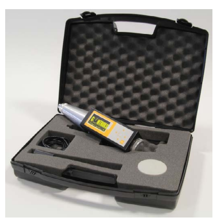
Rebound digital test hammer supplied complete with case (model 58-C0181/DGT)