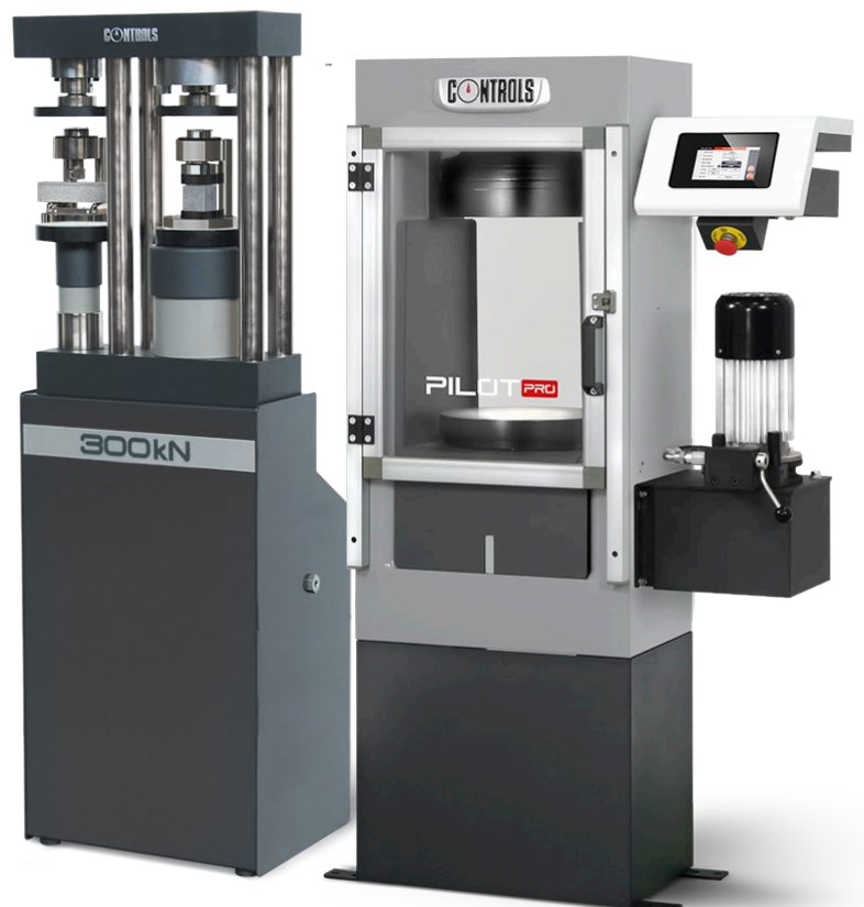
PILOT Pro EN 2000 kN Automatic compression tester 50-C46P02 with 50-C10C/3F three-way valve controlling a double testing chamber 300/15 kN cement frame 50-L28Z10 with accessories