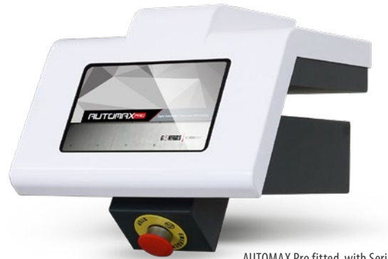
AUTOMAX Pro fitted with Serial Printer

Installation of a serial printer on the AUTOMAX PRO control panel allowing load / time plot.