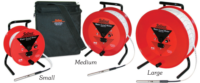
Model 101 Water Level Meter Reels

* Polyethylene tapes are only available in these lengths